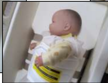
Small and Large Side Facing Restraint Bags