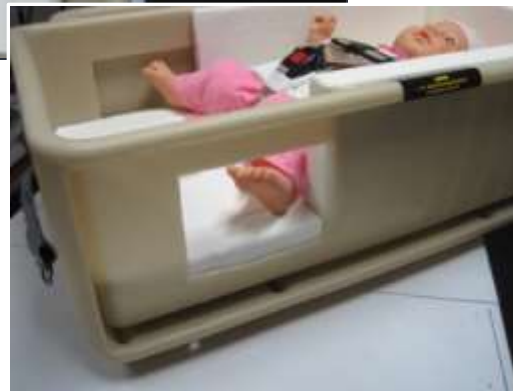
3 pt Harness Child over 10 pounds un-casted