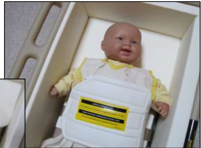
Large Restraint Bag 10 to 35 pounds