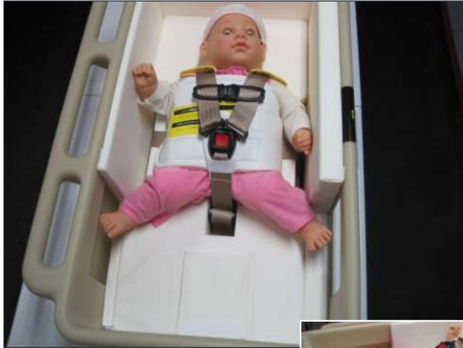
Modified Small Restraint Bag Child 4.5 - 10 pounds un-casted