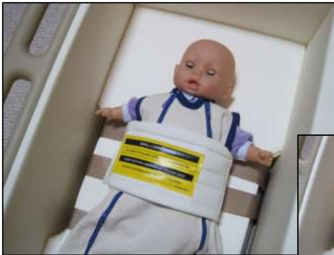
Small Restraint Bag 4.5 to 10 pounds